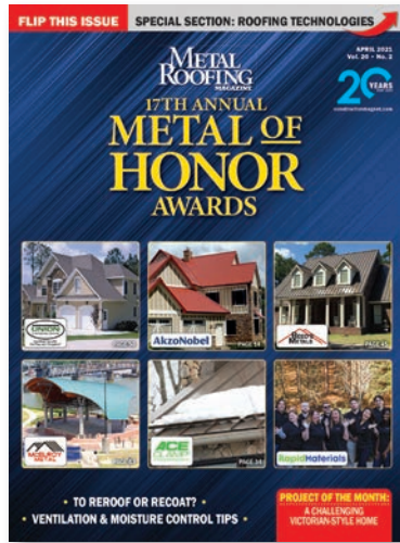
April: Metal of Honor Awards