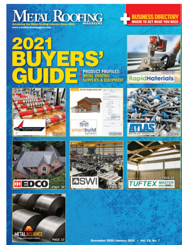
December/January: Metal Roofing Buyers' Guide