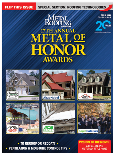
April: Metal of Honor Awards